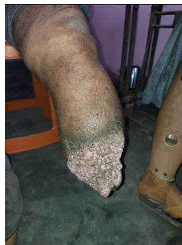
LowerLimb Amputee from Haridwar, Uttarakhand