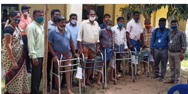
Artificial limbs Lined Up for Distribution at HD Kotte