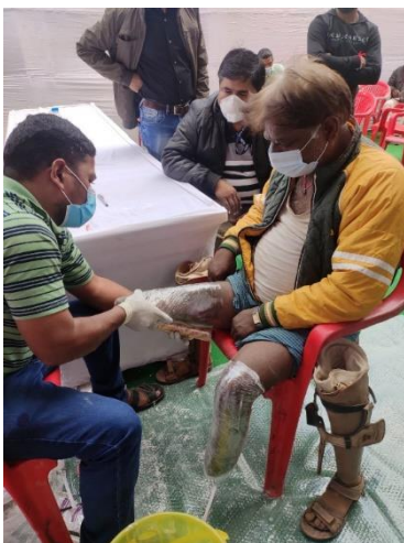
Bilateral Lower Limb Amputee from Patna, Bihar