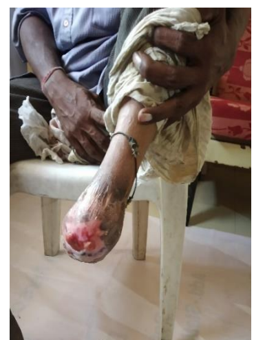
Symes Amputee from Chandrapur, Maharashtra